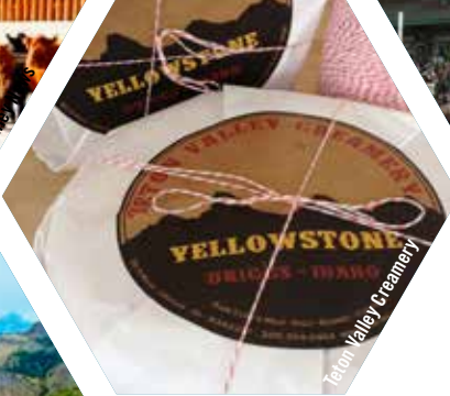
Teton Valley Creamery