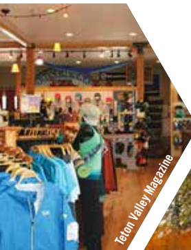
Teton Valley Magazine