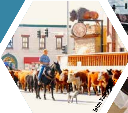
Teton Valley Events