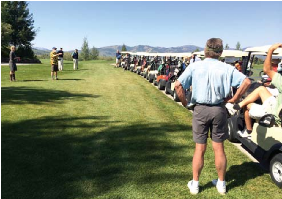
Left: 5th Annual VARD Golf Tournament participants line up for the shot-gun start.