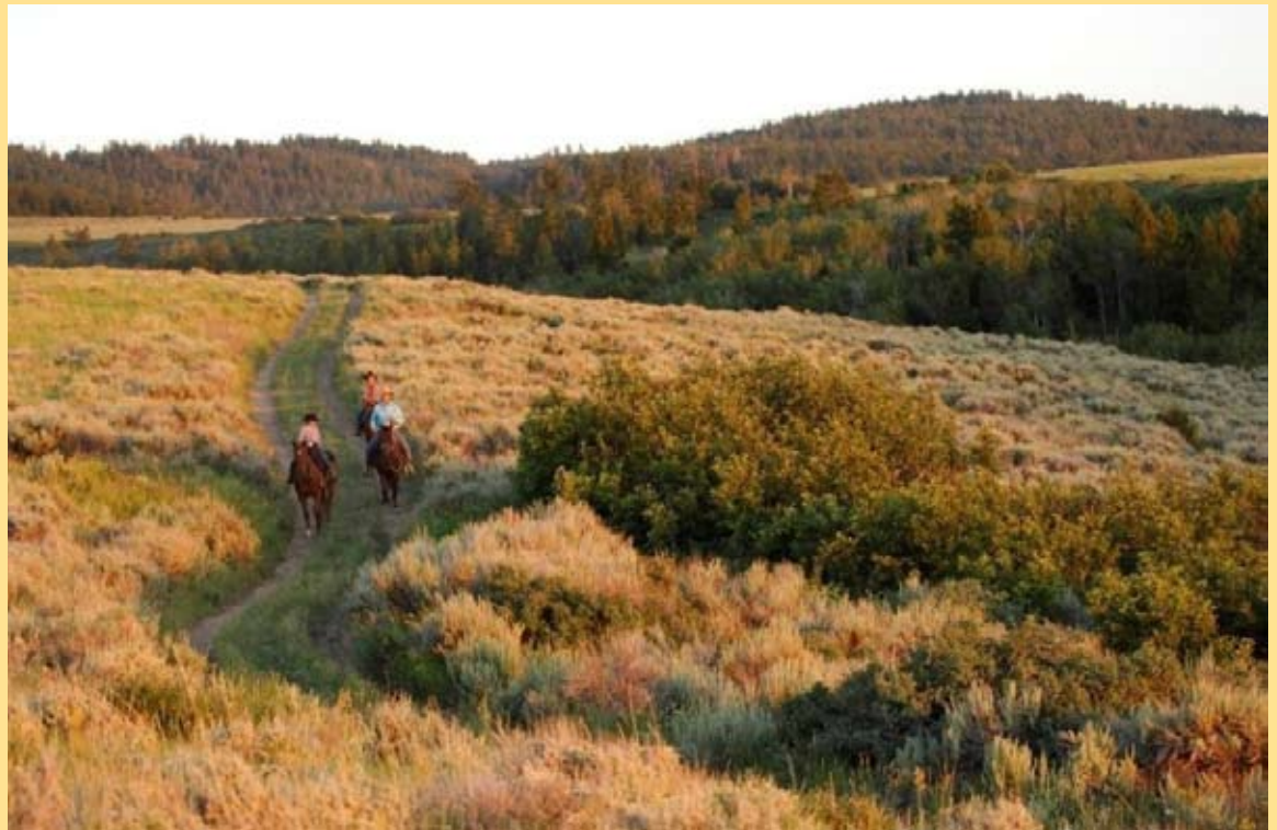
Canyon Creek Ranch